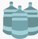
Three-day supply of one gallon of water per person per day